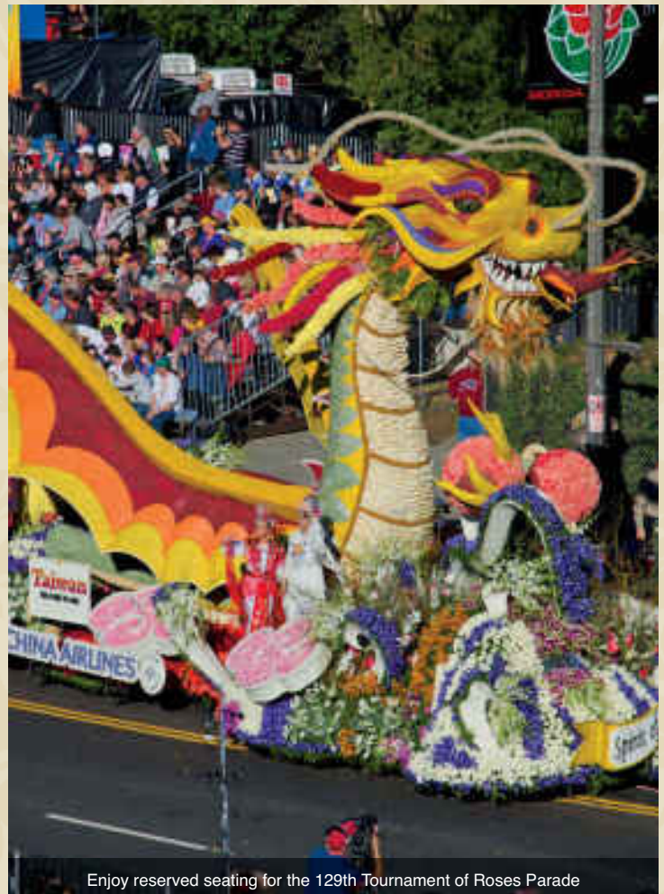
Enjoy reserved seating for the 129th Tournament of Roses Parade

Like all of our holidays, your transfer from the hotel to the airport is included for your flight home. Your Tour Manager will help you with arrangements to Los Angeles International Airport. Meal: B