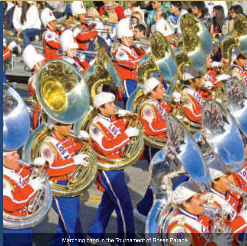
Marching band in the Tournament of Roses Parade