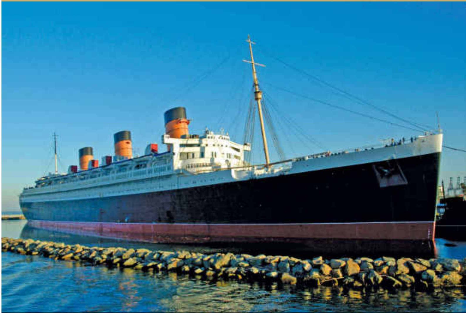
Get a unique glimpse into a bygone era aboard the Queen Mary